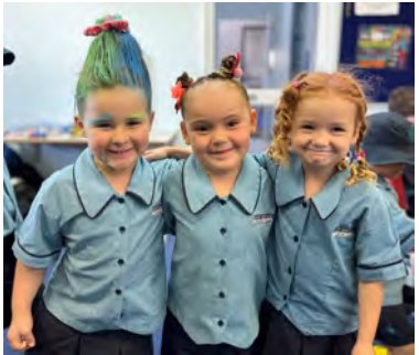
Possum Magic Workshop