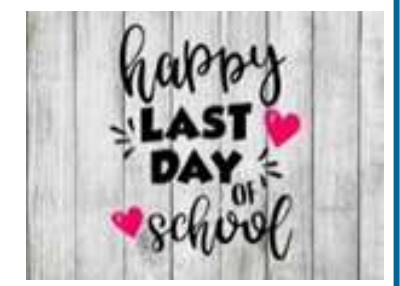
Friday 16 December