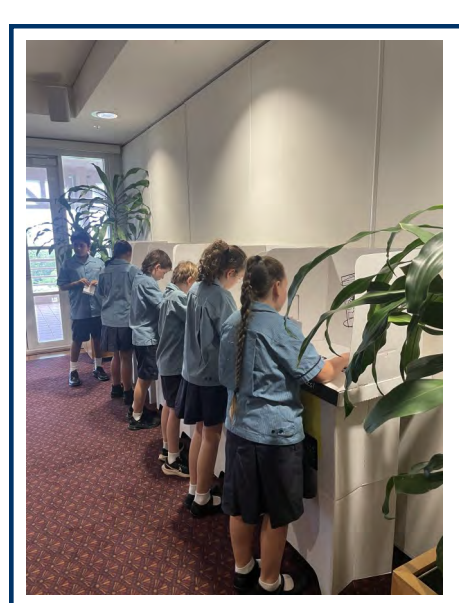
Year 5 Parliament House Excursion