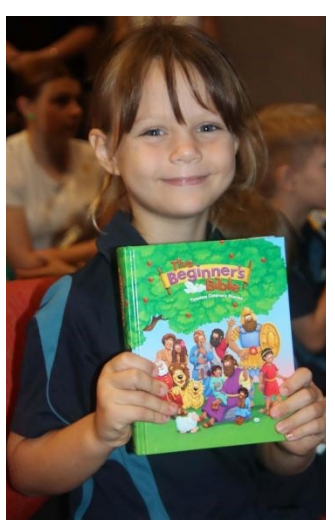
Transition Bibles 7 December 2022